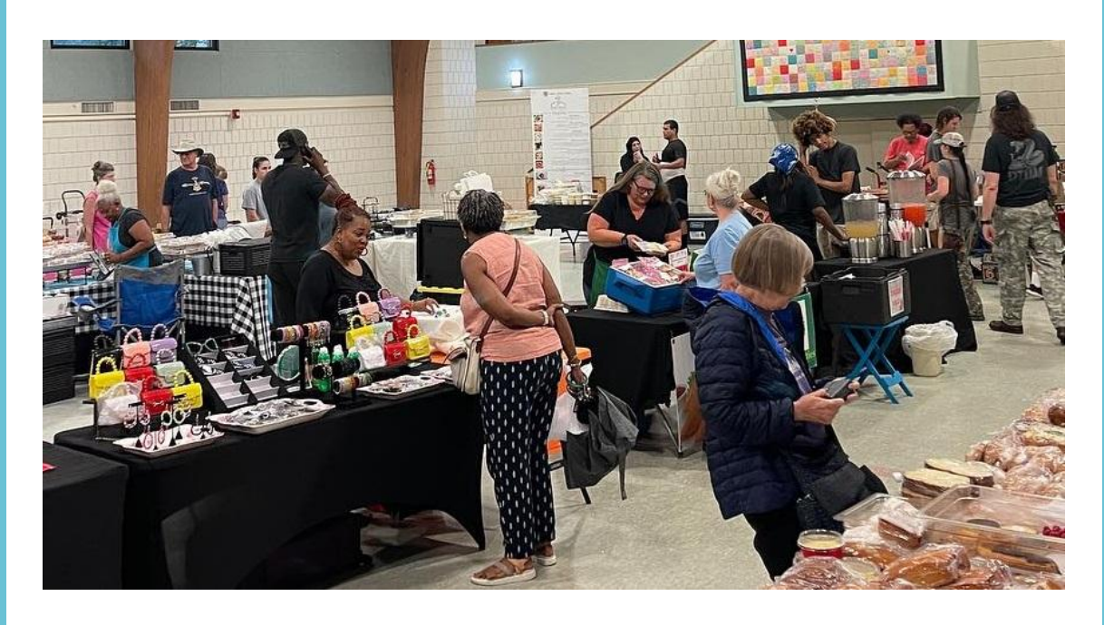
Conversations with our neighbors- we have them all the time!